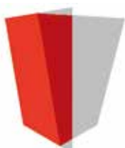
加拿大工料測量師學會 Canadian Institute of Quantity Surveyors