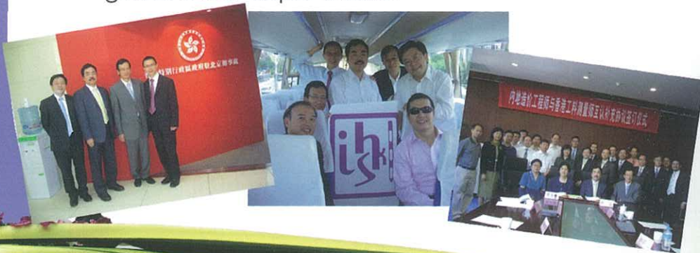
QSD Annual Dinner 28 May 2010