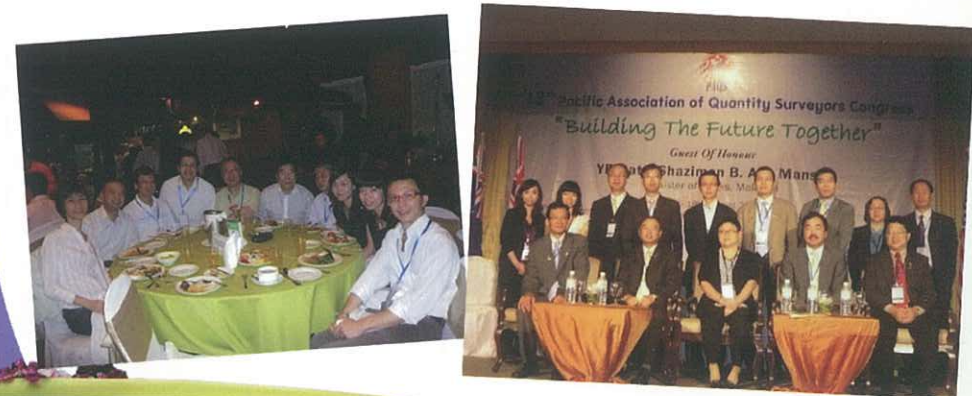
QSD Annual Dinner 28 May 2010